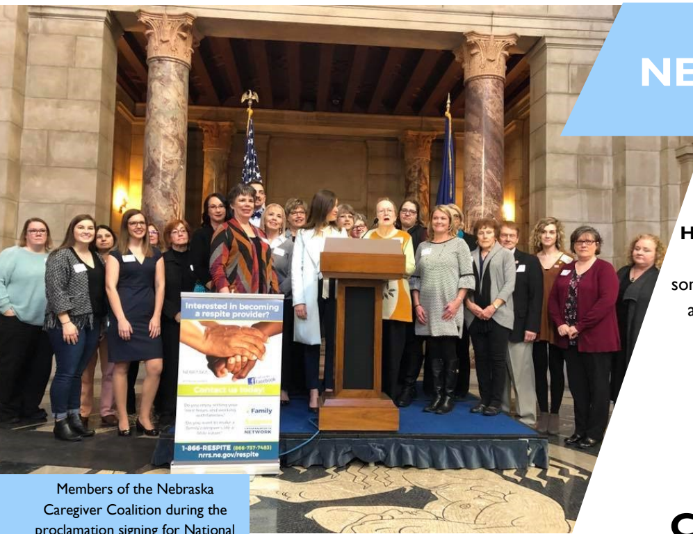
Members of the Nebraska Caregiver Coalition during the proclamation signing for National Family Caregivers Month in November 2018 at the Nebraska State Capitol.